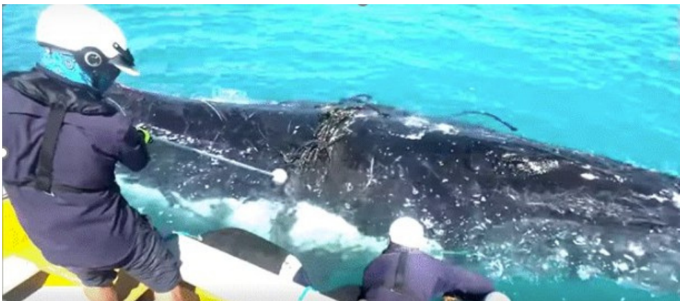
A specially trained team work hard to disentangle the whale

On 15 August 2025, a specially trained Parks and Wildlife Service crew responded to a report of an entangled whale in Kuri Bay. The team flew 370km by helicopter, to find an 11 metre humpback whale heavily entangled in ropes. The team worked with local industry staff for seven hours to carry out a careful and complex operation to successfully disentangle the whale. A great outcome and good example of collaboration with support from local industry.