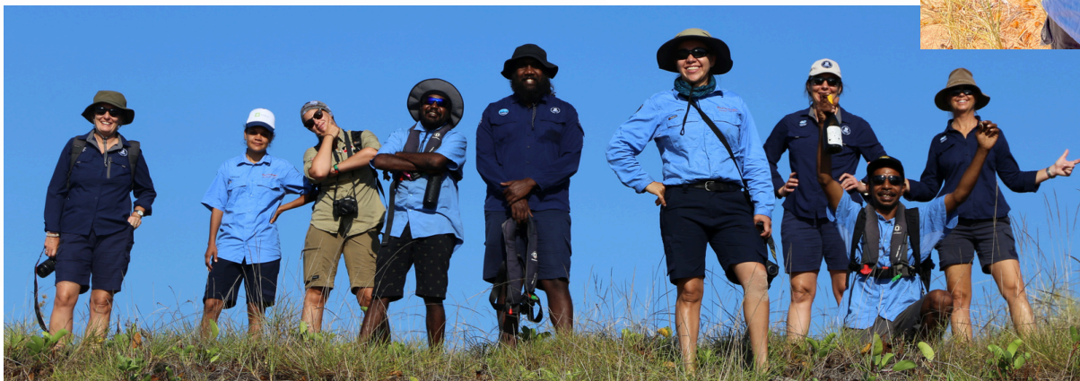
Turtle monitoring team