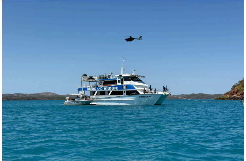
PV Worndoom and an ABF helicopter, collaborating in efforts to detect FFVs

This was the first collaboration of its kind for the groups involved, and it proved highly successful, with strong knowledge-sharing and three-way learning taking place throughout the trip