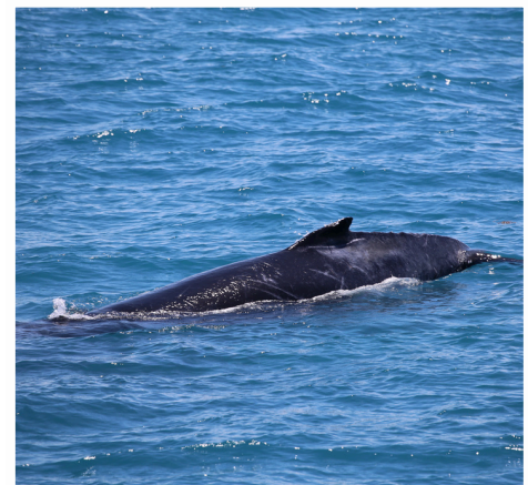
After 7 hrs of careful work, the whale swam free