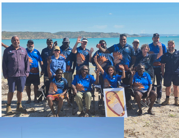
Above: JMB members meet on Country at Yaloon Left: JMB members visit Yowjab