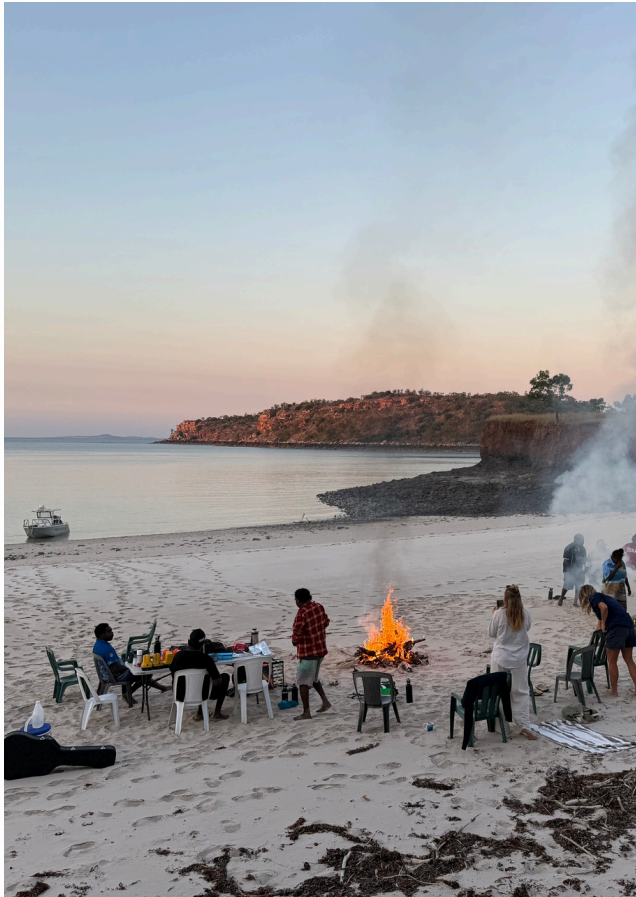
Story time and a camp fire during the on Country expedition