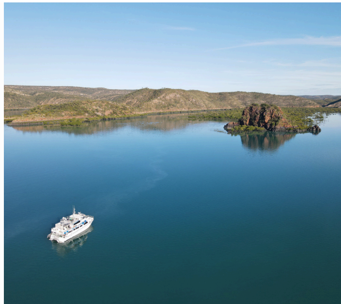
Worndoom anchored in Ganbadba, Talbot Bay