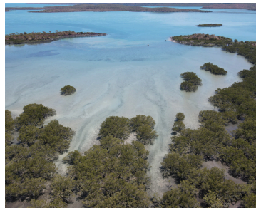
A drone was used to survey large areas of mangrove