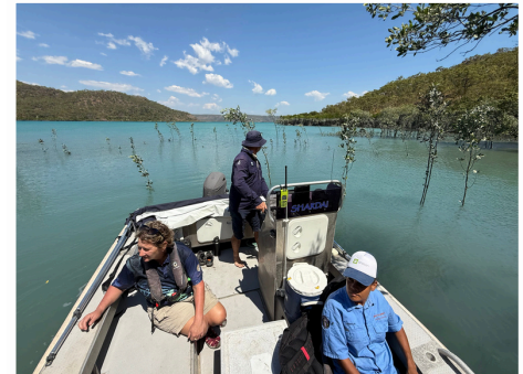
Searching for FFV hides near Augustus Island